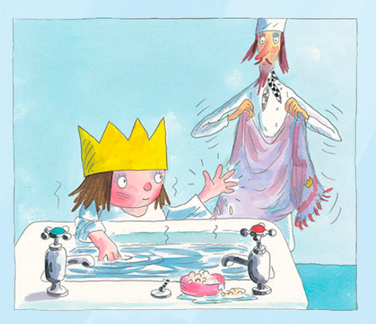
4. Make sure you dry them with something clean.