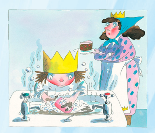
1. Start with some warm water, wet your hands in the sink.