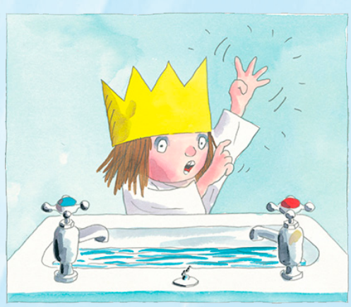
3. After that, rinse your hands with clean water from the tap.