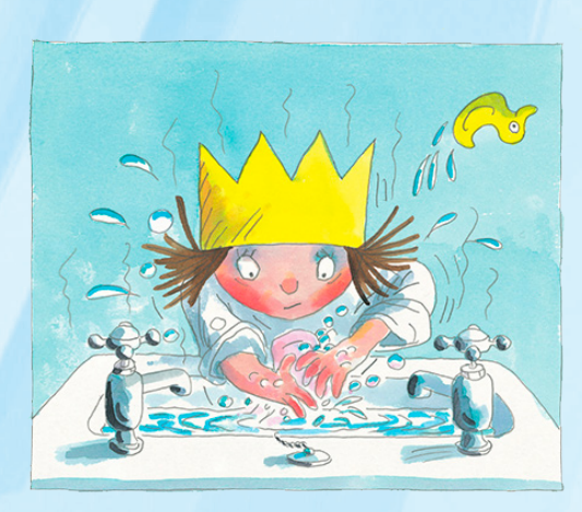
2. Add some soap and rub your hands together for 20 seconds.